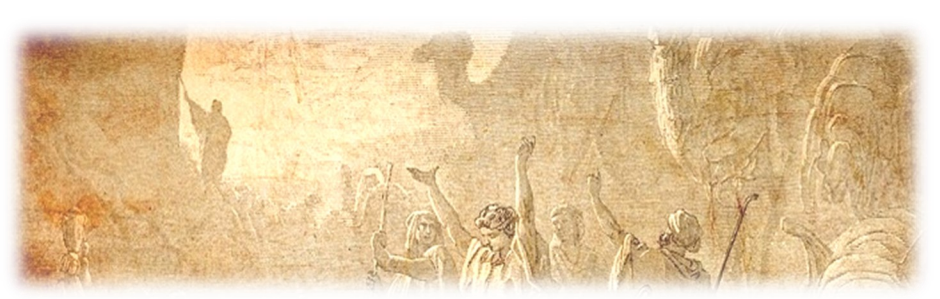
Sunday, May 2, 2021