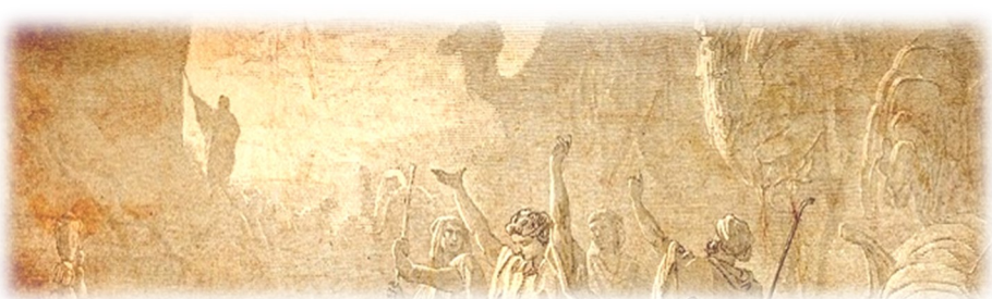
Sunday, July 18, 2021